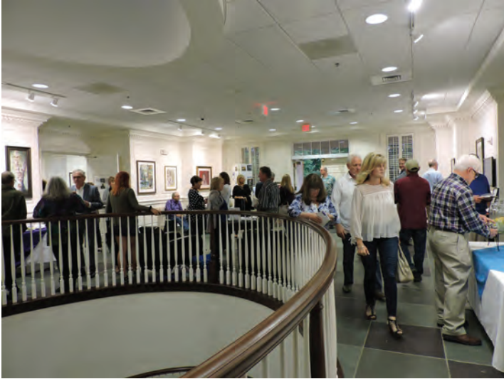
Reception at Cromwell Center, Charlotte, NC, 2017.