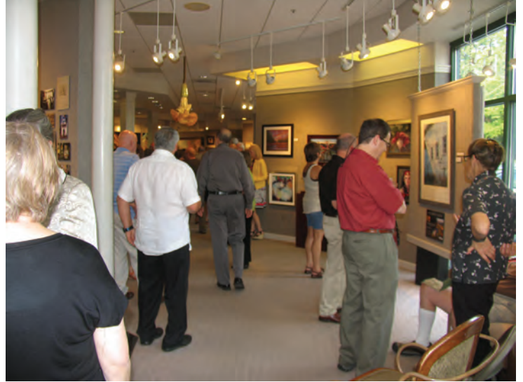
Reception at The Art Shop, Greensboro, NC, 2015.