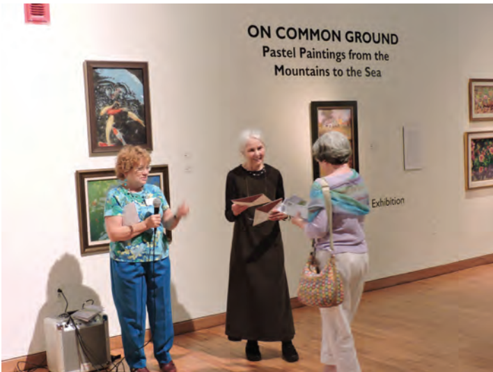
Reception at The Hickory Museum, Hickory, NC, 2016.