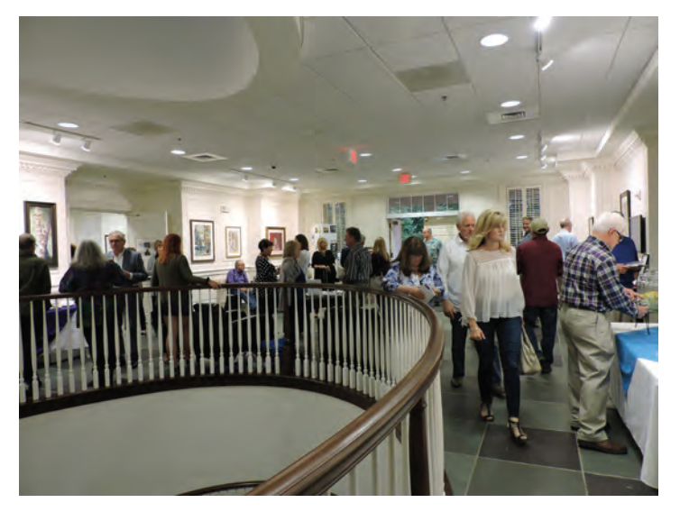
Reception at Cromwell Center, Charlotte, NC, 2017.