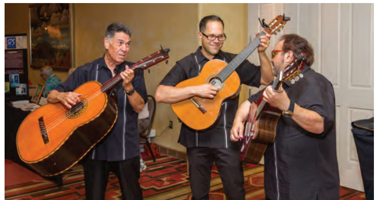
The Mariachi Band is always a big hit!