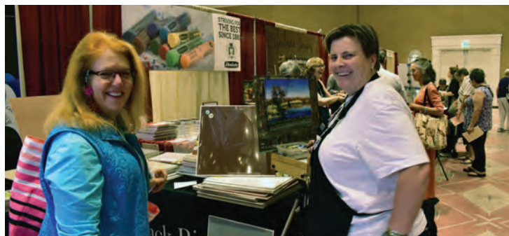
Fun at the Convention Trade Show!