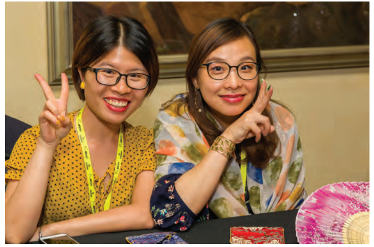
Representatives all the way from China!