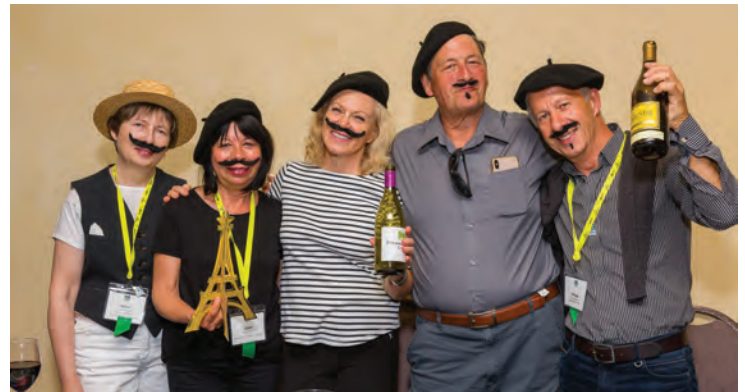
Vive la France! So much fun with wine and mustaches included.