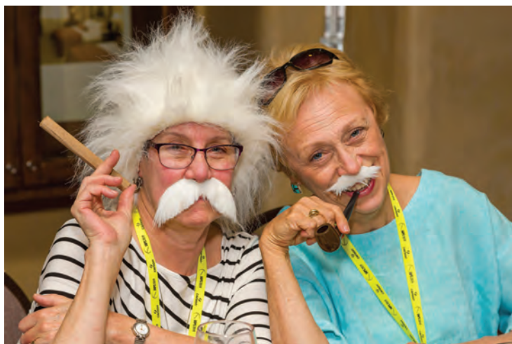
A few Mark Twains showed up to represent the Connecticut Pastel Society at the Friday Night Fiesta!