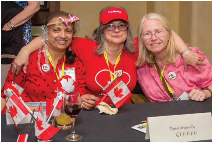
Fiesta Night Shenanigans! The Canadian Contingency